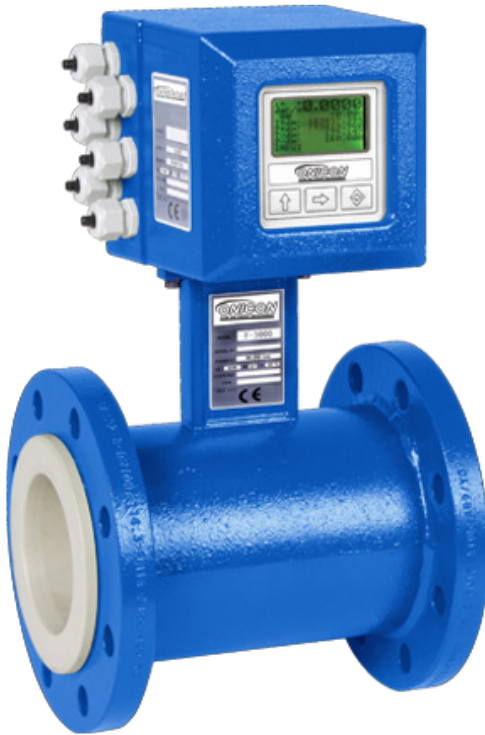
Wafer style meter is also available