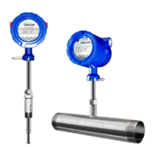
F-5500 Insertion and Inline Thermal Mass Flow Meters

ONICON Thermal Mass Flow Meters provide accurate, reliable flow measurement of natural gas, compressed air and other industrial gases. Thermal mass meters have no moving parts and measure the mass of the fluid directly. This allows them to report standardized volumetric flow rates and totals without the need for temperature or pressure compensation.