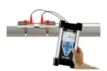
FP-4400 Portable Clamp-on Ultrasonic Flow Meter