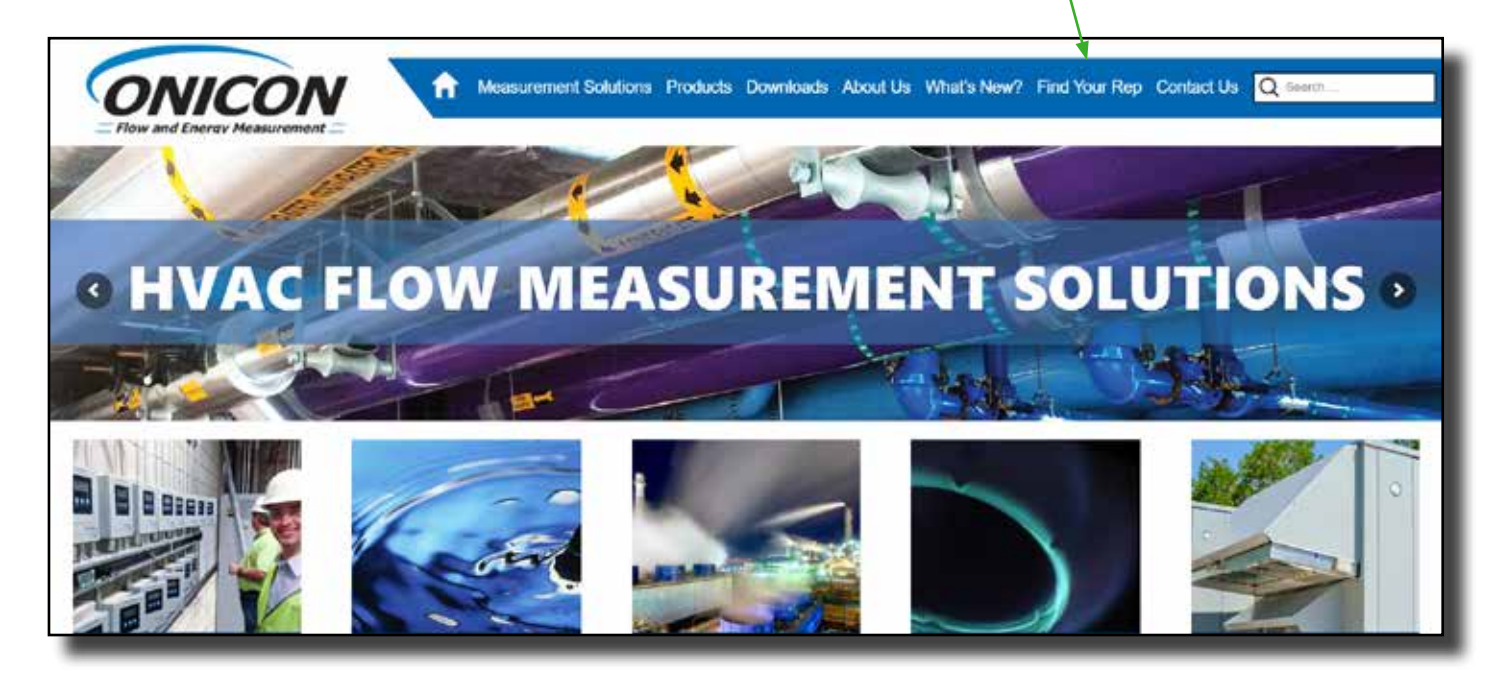
Find a Representative

Additionally, you can contact ONICON directly. ONICON has an experienced staff of knowledgeable sales engineers standing by to assist you. Call today or contact us online at <a href="www.onicon.com">www.onicon.com</a>. Send us an e-mail, use our online quote tool or send us a completed order form to request assistance at any time. Send your inquiry, quote request or completed order form to <a href="sales@onicon.com">sales@onicon.com</a> today.