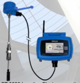
FT-3500 Insertion Electromagnetic Thermal Energy Measurement System

ONICON offers a variety of BTU metering systems designed for measuring thermal energy in water based systems. All ONICON thermal energy measurement systems are delivered fully programmed for your application and are ready to use right out of the box.