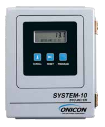
System-10 BTU Meter