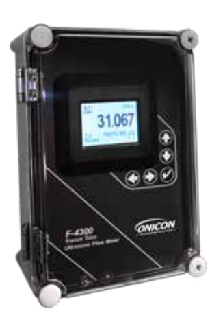
F-4300 Clamp-on Ultrasonic Flow Meter