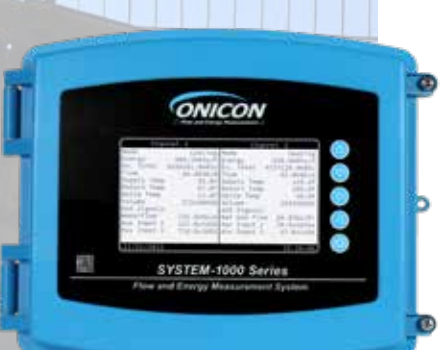
System-1000 Flow and Energy Measurement System

The System-1000 is a multi-input interface that provides a single network point for up to eight devices. Its innovative design allows dual channel energy measurement and is the ideal solution to accurately measure and report thermal energy usage, flow, temperatures, and efficiency.