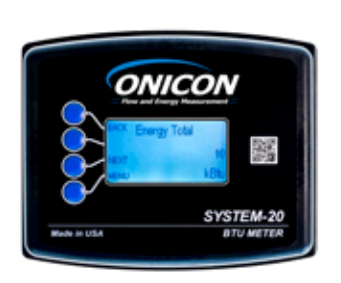
System-20 BTU Meter