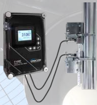
F-4300 Clamp-on Ultrasonic Thermal Energy Measurement System