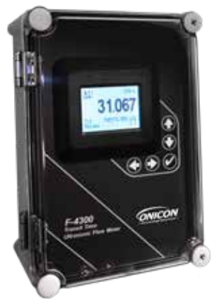
F-4300 Clamp-on Ultrasonic Flow Meter