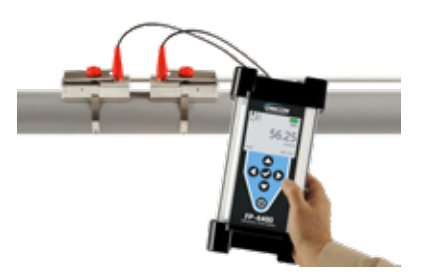
FP-4400 Portable Clamp-on Ultrasonic Flow Meter