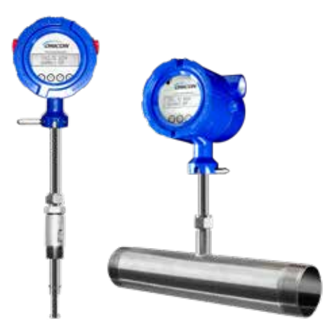
F-5500 Insertion and Inline Thermal Mass Flow Meters

ONICON Thermal Mass Flow Meters provide accurate, reliable flow measurement of natural gas, compressed air and other industrial gases. Thermal mass meters have no moving parts and measure the mass of the fluid directly. This allows them to report standardized volumetric flow rates and totals without the need for temperature or pressure compensation.