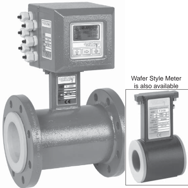
Wafer Style Meter is also available

Faraday's Law states that a voltage will be induced in a conductor (the conductive fluid) when it passes through a magnetic field (generated by the meter) and that voltage will be directly proportional to the velocity of the conductor (the fluid). This voltage is measured by electrodes on opposite sides of the flow tube and used to calculate the flow velocity.