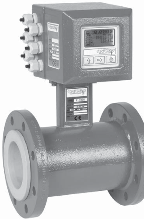
Wafer Style Meter is also available