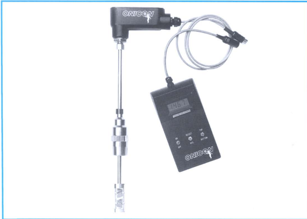
Model D-1402 Shown

The D-1400 series of Portable Display Modules are battery powered, hand held units which can be taken into the field wherever flow measurements are needed. An internal battery powers both the liquid crystal display and an ONICON single or dual turbine flow meter. The display module and flow meter together make up a complete metering system which can be used to accurately determine the flow rate in full pipes and open flow channels. Hot tap valve assemblies enable one of these portable systems to measure flow rates in multiple locations.