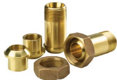
Process connections are available with sweat union or threaded connections.

The System-30 is sold complete with integral flow meter, temperature sensors and (1) standard thermowell. Please refer to the ONICON catalog for available options.