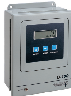
The optional D-100 Flow Display provides a local indication of rate and total and a network interface for BACnet, MODBUS, LonWorks, JCI - N2, or Siemens - P1 FLN networks.