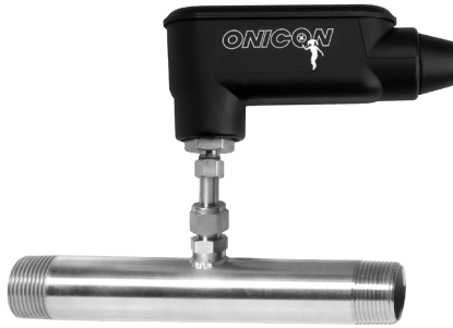
Made in America