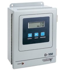
Optional D-100 Display